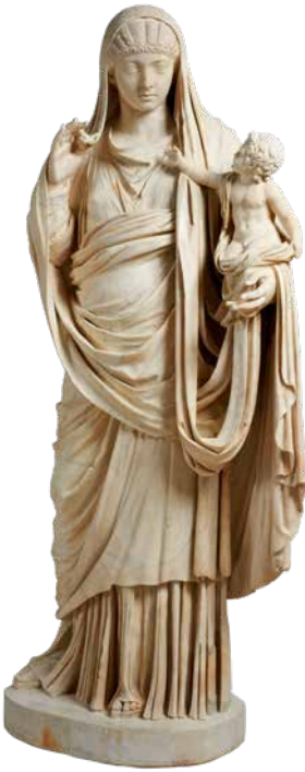
Messaline et Britannicus, vers 50, marbre. Paris, musée du Louvre, département des Antiquités grecques, étrusques et romaines.

In January 41, just before acceding to the throne, Claudius was almost 50 years old. Pushed aside from public life by his family, he had devoted his life to his studies, especially history. He was a scholar who had acquired his knowledge from books and the teachings of his tutors. He introduced three new letters into the Latin alphabet in order to represent certain sounds more accurately. However, his various engagements and marriages show that he did play a role in dynastic matrimonial strategies. Between 4 and 8 AD, he was engaged twice: to Æmilia Lepida, the great-granddaughter of Augustus, and then to Livia Medullina. Shortly afterwards, he married Plautia Urgulanilla, the granddaughter of a friend of his grandmother Livia, who gave him a son, Claudius Drusus (but the little boy died in an accident); the couple divorced around 24. Shortly afterwards, Claudius married Ælia Paetina (whom he repudiated in 31), and they had a daughter, Antonia, around 25–27 AD. As of 38–39 AD, he was the husband of his young cousin Messalina, with whom he had a daughter, Octavia, and then a son Tiberius Claudius Germanicus (nicknamed Britannicus), who was born in 41. This was the first time that a son was born to an emperor during his reign.