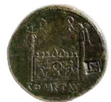
Sesterce d'Auguste à l'autel des Trois Gaules (revers), Atelier de Lyon, 9-10 - 14 ap. J.-C., laiton. Lyon, musée des Beaux-Arts.