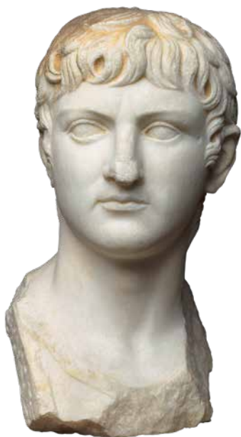
Germanicus, vers 10, marbre. Paris, musée du Louvre, département des Antiquités grecques, étrusques et romaines.

Tiberius' reign continued along the same lines established under Augustus. He consolidated authority and stabilized the empire. However, rivalries within the imperial dynasty, which were stoked by his mother Livia, worsened, and Tiberius responded with violence. Germanicus was probably one of his victims. Having returned victorious from the Germanic campaigns, Germanicus was sent to the East to put down uprisings. He died in Antioch, near Syria, probably from being poisoned, in 19 AD. The announcement of his death caused public mourning and the Senate granted him funerary honors.