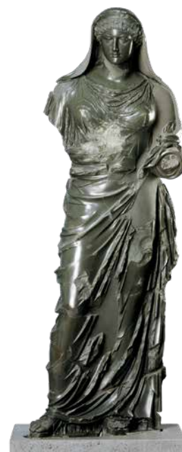
Agrippine la Jeune en flaminique , après 54 ap. J.-C., Grauwacke; résine moderne (tête). Rome, Musées Capitolins, Centrale Montemartini.

Nero, the son of the Divine Claudius, ruled for fourteen years. The Julio-Claudian dynasty ended with his death in 68.