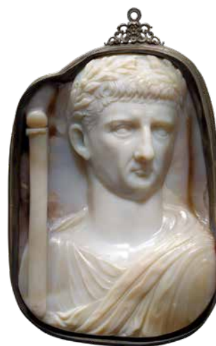
Camée: Claude , Rome, règne de Claude, Calcédoine (monture: argent doré). Vienne, Kunst Historisches Museum, département des antiquités grecques et romaines.