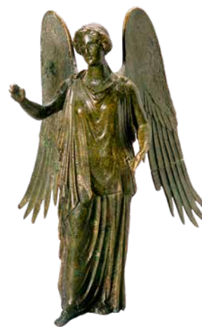
Victoire , fin du I er -II e siècle, alliage cuivreux. Lugdunum - Musée et théâtres romains.