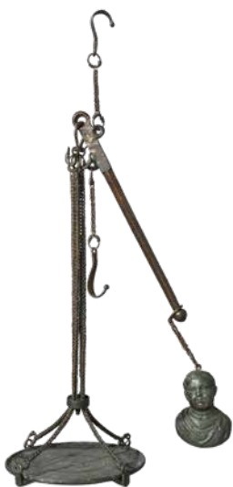
Balance romaine, Pompéi, 47, bronze. Naples, Musée Archéologique National.

Elder, his father; Antonia the Younger, his mother, the daughter of Octavia (Augustus' sister) and Marc Antony; and especially Germanicus, his deceased brother. Claudius naturally had his place within this prestigious lineage and was depicted ensuring the future of the dynasty through images of his wives, Messalina and then Agrippina, and his son, Britannicus. Throughout the empire, the circulation of portraits of the deceased and living family members (sculptures, coins, and cameos) served as propaganda for the Julio-Claudians.