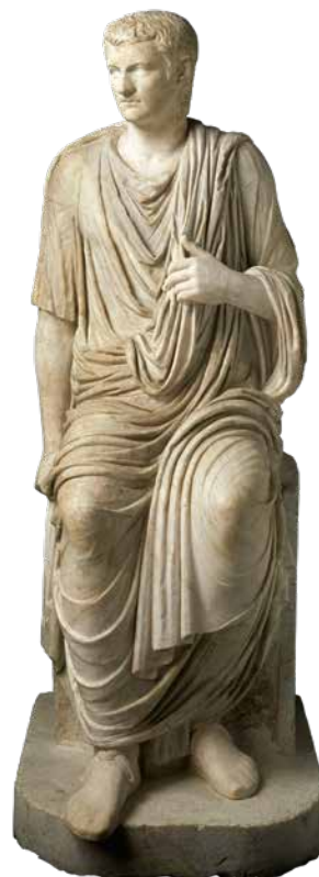
Caligula, vers 40, marbre. Paris, musée du Louvre, département des Antiquités grecques, étrusques et romaines.

The emperor's violence and downward spiral caused his death. It seems that Claudius had been informed of the conspiracy against his nephew and decided to turn a blind eye to it.