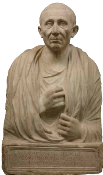
Portrait funéraire de l'affranchi Caius Auruncius Prineps, Rome, vers 40-50, marbre. Bruxelles, musées royaux d'Art et d'Histoire.

Another important measure during his reign was the census that took place in 47-48. This large-scale operation was intended to register all citizens of the empire and to classify them according to their wealth in order to establish the amount they had to pay in taxes. This was also a way of verifying the list of senators and equestrians, based on their wealth. Above all, Claudius is famous for supporting the request of the notables of the Gallic provinces in 48 to have access to senatorial-level appointments and therefore to the Senate – an innovation that was met with great hostility by the Roman Senate. His speech is recorded on the Claudian Tablet. That same year, the emperor made a lasting impression by holding splendid ceremonies (Saecular Games) for the celebration of the 800th anniversary of the founding of Rome.