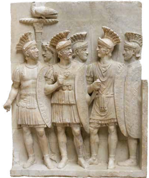
Relief historique, dit Relief des Prétoriens , vers 51-52, marbre. Paris, musée du Louvre, département des Antiquités grecques, étrusques et romaines.

The monumental arch of the Aqua Claudia and Anio Novus aqueducts, which is currently the Porta Maggiore in Rome, was dedicated by Claudius in 52, and is the only Claudian monument preserved on the site where it was elevated.