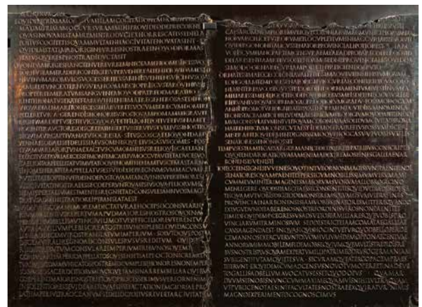
Table Claudienne, ap. 48, bronze. Lugdunum – Musée et théâtres romains.